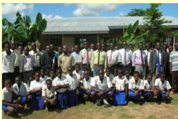
Learners and Teachers are Benefiting from the Programme.

Peer Health Education has been identified as a reliable and sustainable initiative that countries can use as a mitigation strategy on various impacts of HIV & AIDS. Initially, the programme was initiated and promoted by UNESCO Headquarters in Paris which trained 21 countries in Africa. Assessment has indicated that Peer Health Education is one of the most reliable instruments in spreading knowledge and educating masses in a simple and entertaining manner. The Programme indicated that the multiplier effect is very high as a group of ten peer educators performing and imparting knowledge to a crowd are likely to reach over 100 people within an hour and that those 100 people have the potential to reach the wider community of about 1000 people within a day.