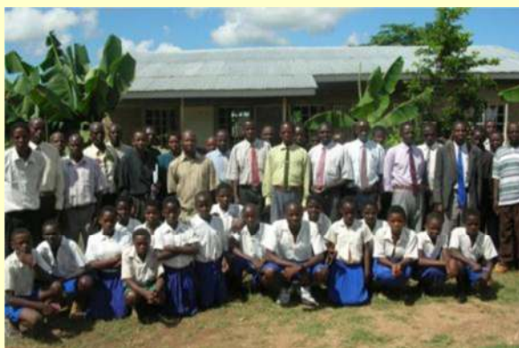
Learners and Teachers are Benefiting from the Programme.

Peer Health Education has been identified as a reliable and sustainable initiative that countries can use as a mitigation strategy on various impacts of HIV & AIDS. Initially, the programme was initiated and promoted by UNESCO Headquarters in Paris which trained 21 countries in Africa. Assessment has indicated that Peer Health Education is one of the most reliable instruments in spreading knowledge and educating masses in a simple and entertaining manner. The Programme indicated that the multiplier effect is very high as a group of ten peer educators performing and imparting knowledge to a crowd are likely to reach over 100 people within an hour and that those 100 people have the potential to reach the wider community of about 1000 people within a day.