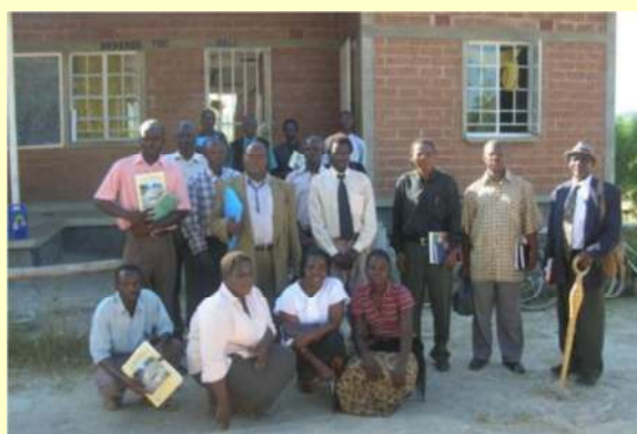
Community Leadership Benefiting from the Programme

Peer Health Education aims at encouraging community groupings in schools, work places, villages and any human setting to initiate small groupings that are empowered with knowledge of how to pass on various messages related to HIV & AIDS. The tool is used as a crosscutting initiative that can also be used on any other subject apart from HIV & AIDS. For example, GCYDCA is working with the Network of Teacher Educators Responding to AIDS (NTERA) in Africa, to initiate Peer Health Education through the Learner Centered Approach in the teacher training colleges. So far, the coordinating NTERA office of Malawi has embarked on training NTERA Malawi, Tanzania and Namibia on Peer Health Education using lecturers as a means of spreading the strategy. Colleges are encouraged to use the strategy as a crosscutting tool across all subjects in order to ensure that every student graduates with Peer Health Education methodologies and programme management. Other countries such as Swaziland are using youth as Supper Buddies who concentrate on reaching fellow youth in schools and general communities where they use drama, speeches and debates as a way of spreading messages on HIV & AIDS. Ministries of Education in Zambia, Uganda, Kenya and Tanzania have partnered with various organizations such as FAWE in promoting Peer Health Education through their HIV & AIDS programmes.