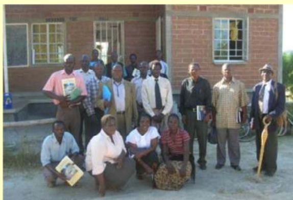
Community Leadership Benefiting from the Programme

Peer Health Education aims at encouraging community groupings in schools, work places, villages and any human setting to initiate small groupings that are empowered with knowledge of how to pass on various messages related to HIV & AIDS. The tool is used as a crosscutting initiative that can also be used on any other subject apart from HIV & AIDS. For example, GCYDCA is working with the Network of Teacher Educators Responding to AIDS (NTERA) in Africa, to initiate Peer Health Education through the Learner Centered Approach in the teacher training colleges. So far, the coordinating NTERA office of Malawi has embarked on training NTERA Malawi, Tanzania and Namibia on Peer Health Education using lecturers as a means of spreading the strategy. Colleges are encouraged to use the strategy as a crosscutting tool across all subjects in order to ensure that every student graduates with Peer Health Education methodologies and programme management. Other countries such as Swaziland are using youth as Supper Buddies who concentrate on reaching fellow youth in schools and general communities where they use drama, speeches and debates as a way of spreading messages on HIV & AIDS. Ministries of Education in Zambia, Uganda, Kenya and Tanzania have partnered with various organizations such as FAWE in promoting Peer Health Education through their HIV & AIDS programmes.